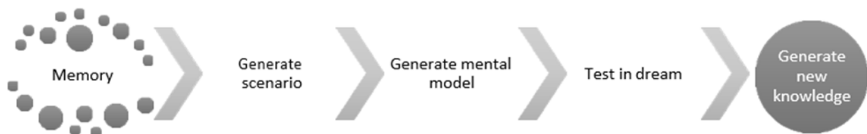
Figure 3. Using past memory to generate new knowledge. Past data is used to generate training data which is combined with new models. This yields new insights and knowledge into a system of interest. This “reverie” model generates new knowledge by combining stored information with a capability to mutate and process that information.

Organisms store information on past actions in memory. They use memories to learn from them, generate new future scenarios from past data and train on this data (Fig. 3). These “reveries” will allow intelligent organisms to effectively combine past actions with newly acquired knowledge. We hypothesize that this leads to more intelligence and ultimately lead to a form of consciousness.